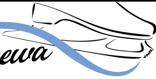
FIGURE SKATING CLUB